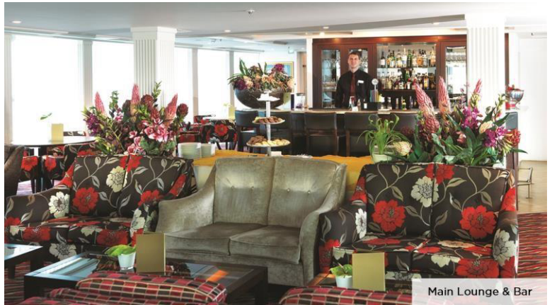
Main Lounge & Bar